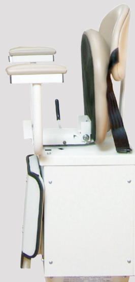
Folds to 14" (35.6 cm)