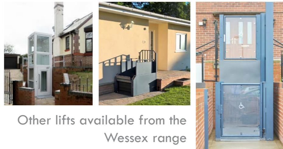
Other lifts available from the Wessex range